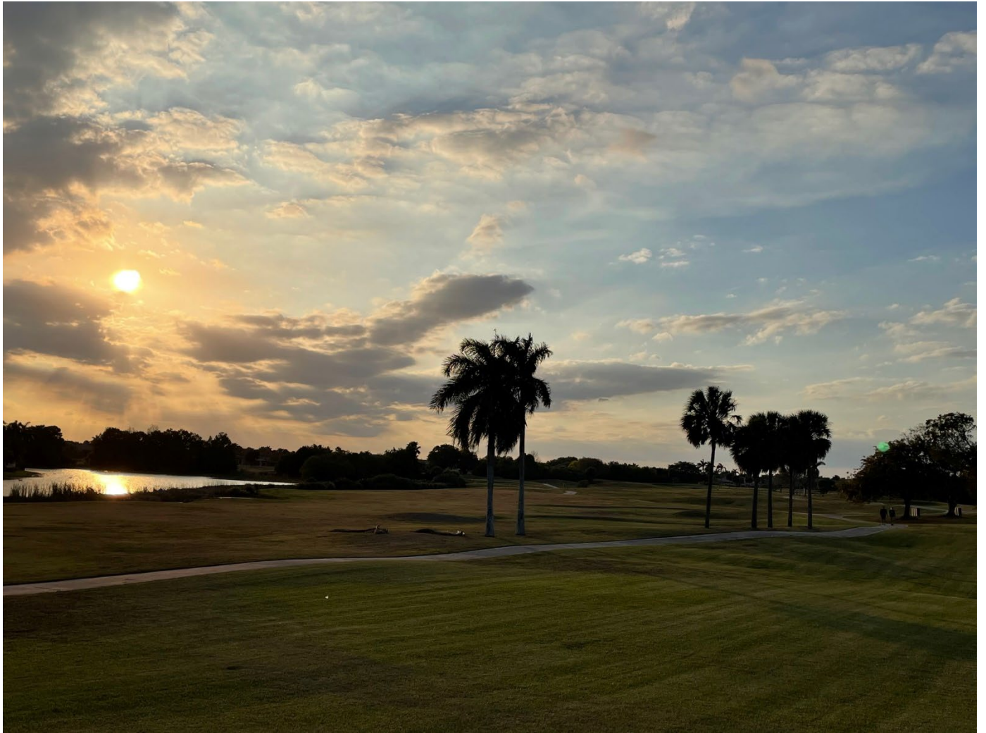
Memorial site looking northwest