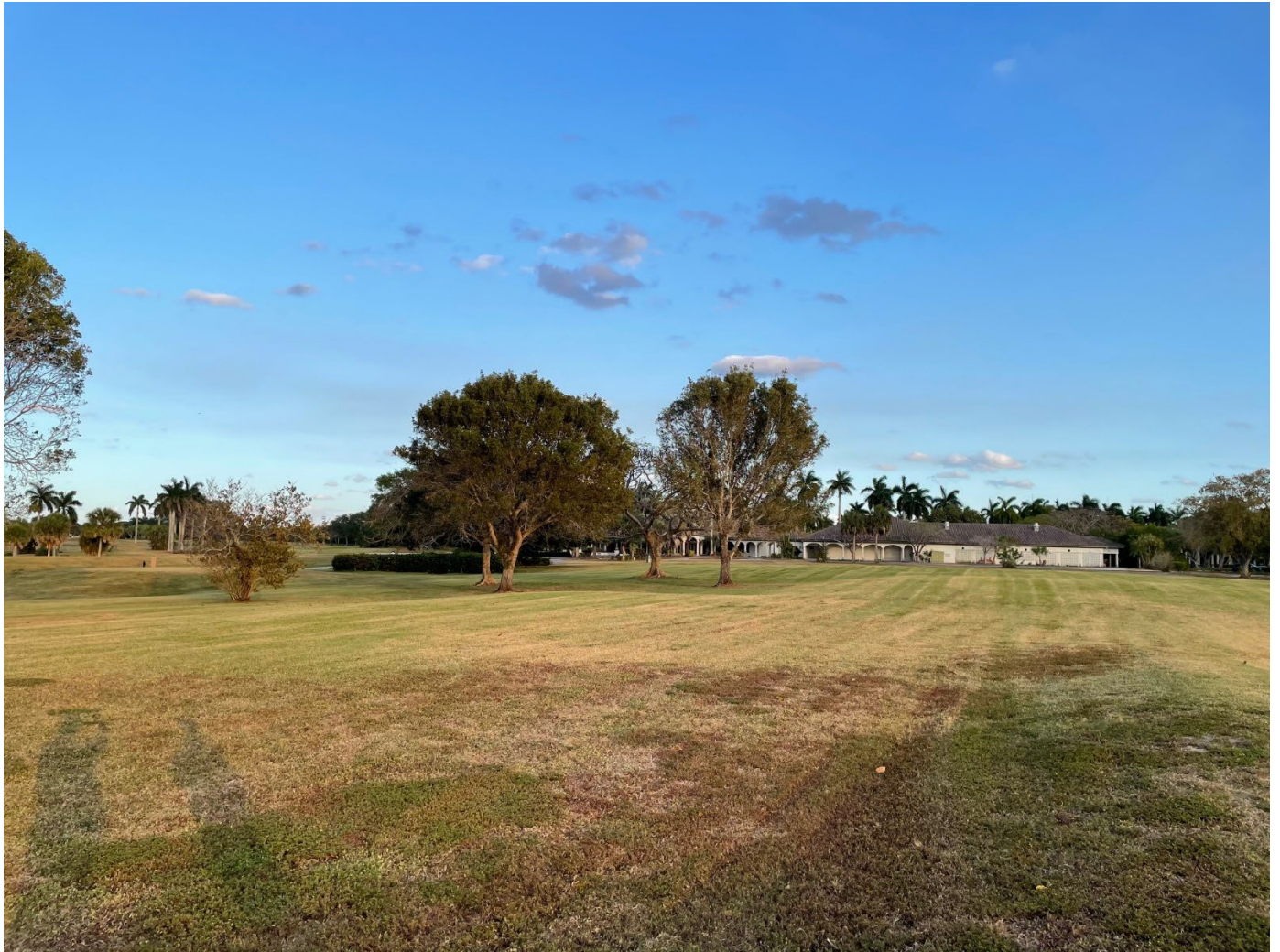
Memorial site looking east