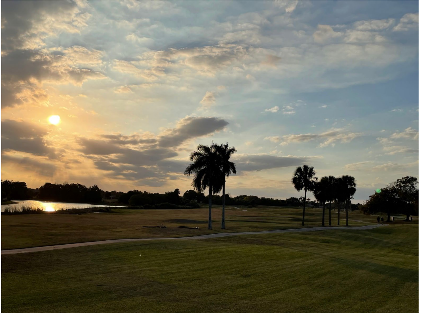
Memorial site looking northwest

This Call to Artists is open to professional artists and design professionals, eighteen years of age or older; residing in the United States. Design teams consisting of an artists and landscape architect are encouraged to apply and collaborate with other professionals including engineers, contractors, or architects. Applicants should demonstrate through their submission materials that they have the skills and experience to successfully complete the project.