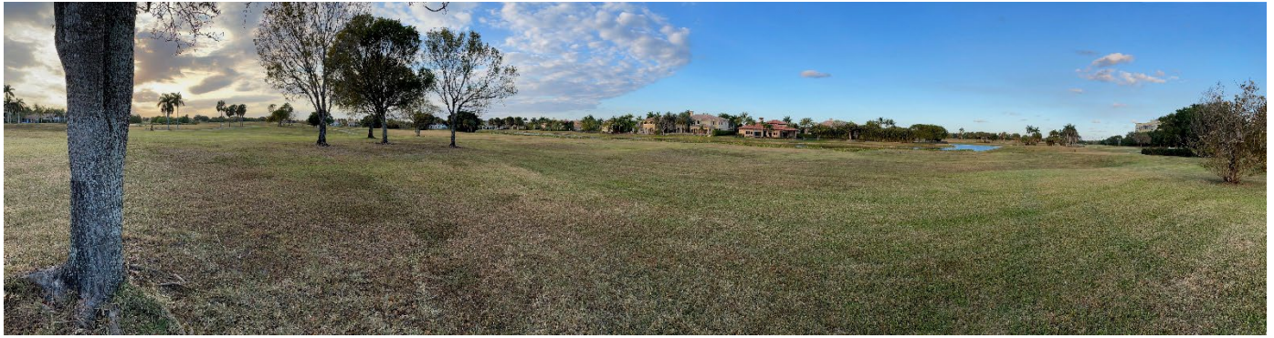
Panorama of memorial site