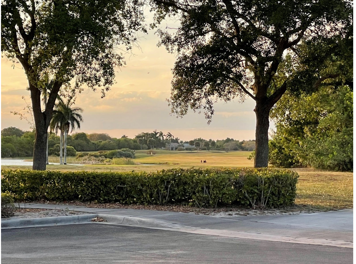
Memorial site as seen from southeast parking area