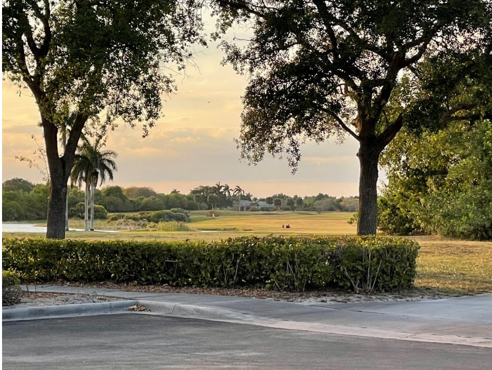
Memorial site from southeast parking area

The outdoor permanent memorial will be located within the North Springs Improvement District's nature preserve. The nature preserve borders the cities of Parkland and Coral Springs. The site has been leased to the Parkland 17 Memorial Foundation for the memorial.