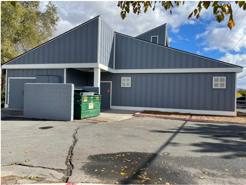
West side of Teglia's Paradise Park Activity Center