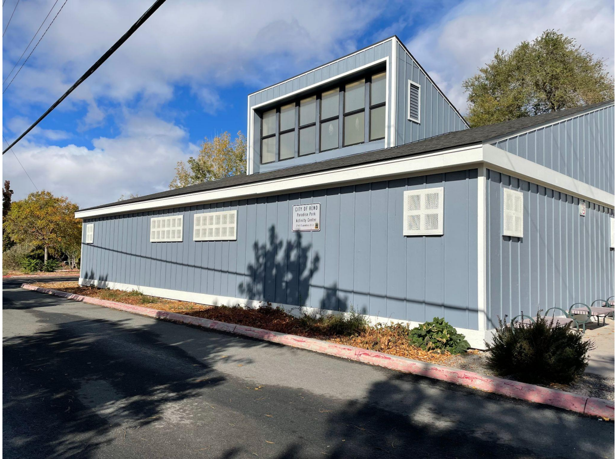
South side of Teglia's Paradise Park Activity Center