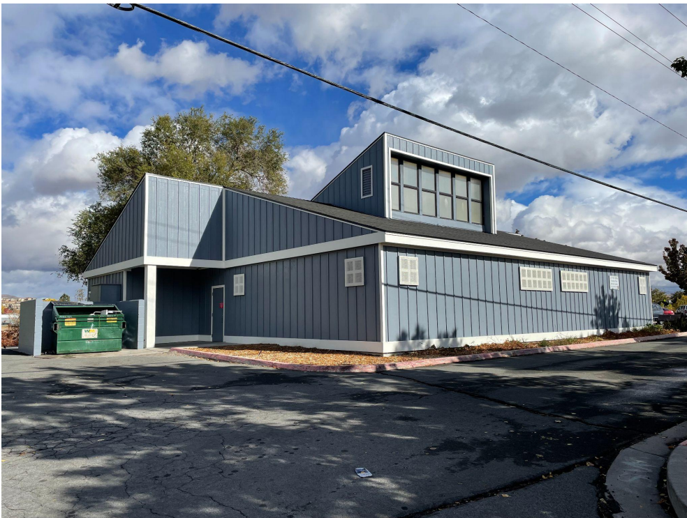
View of south and west sides of Teglia's Paradise Park Activity Center