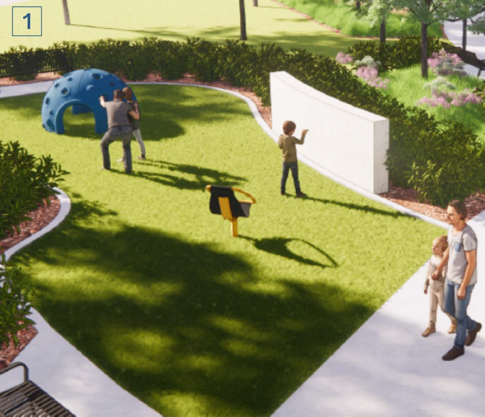
SENSORY ART WALL