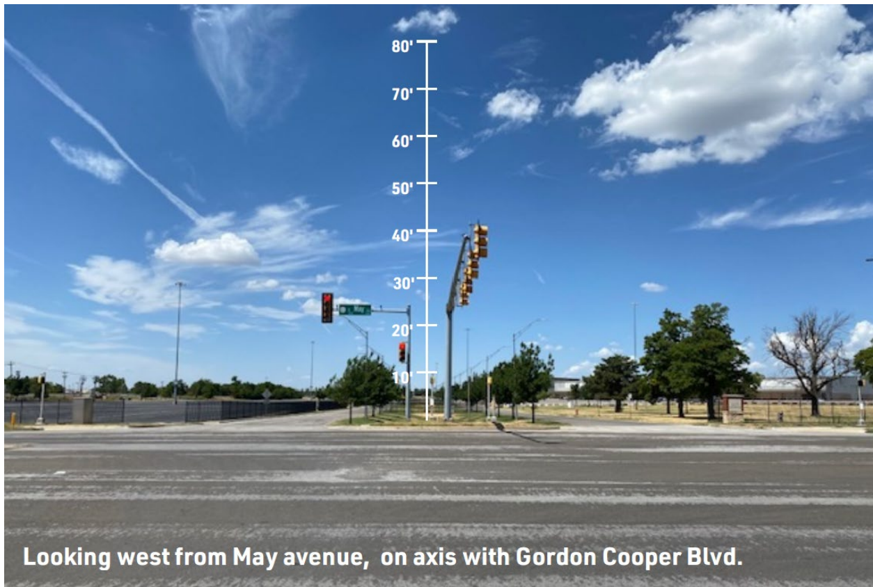
Looking west from May avenue, on axis with Gordon Cooper Blvd.