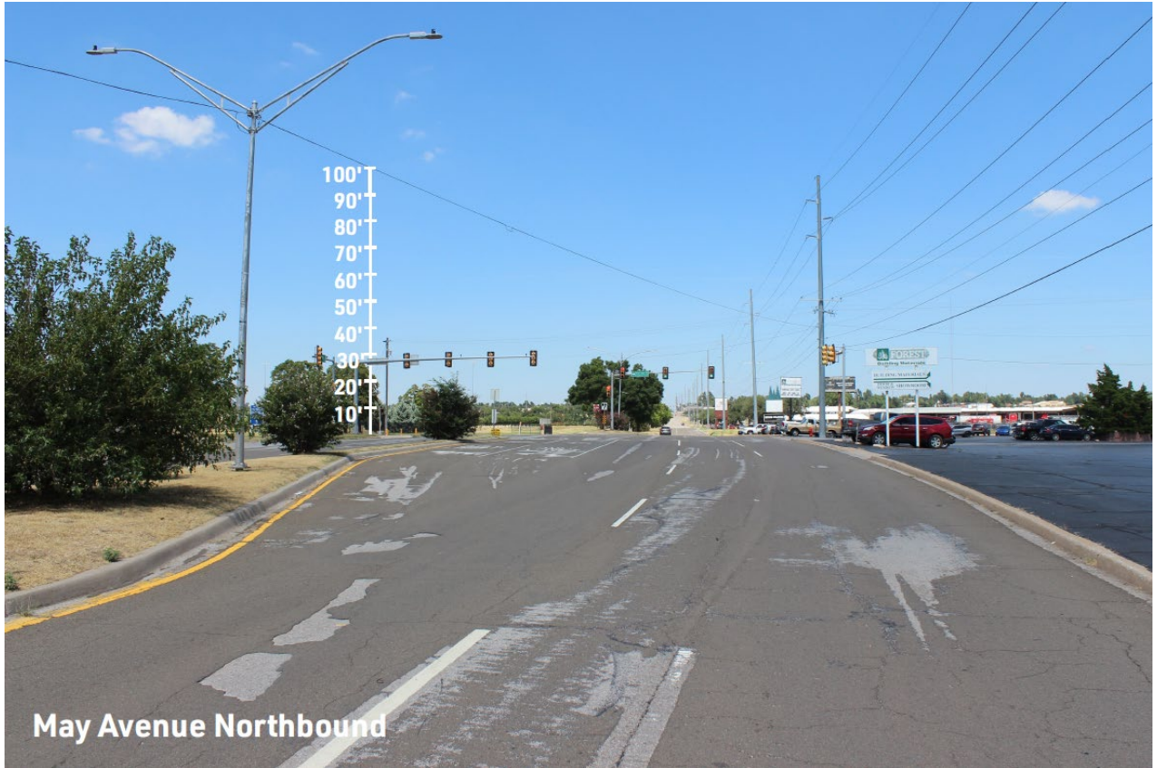
May Avenue Northbound