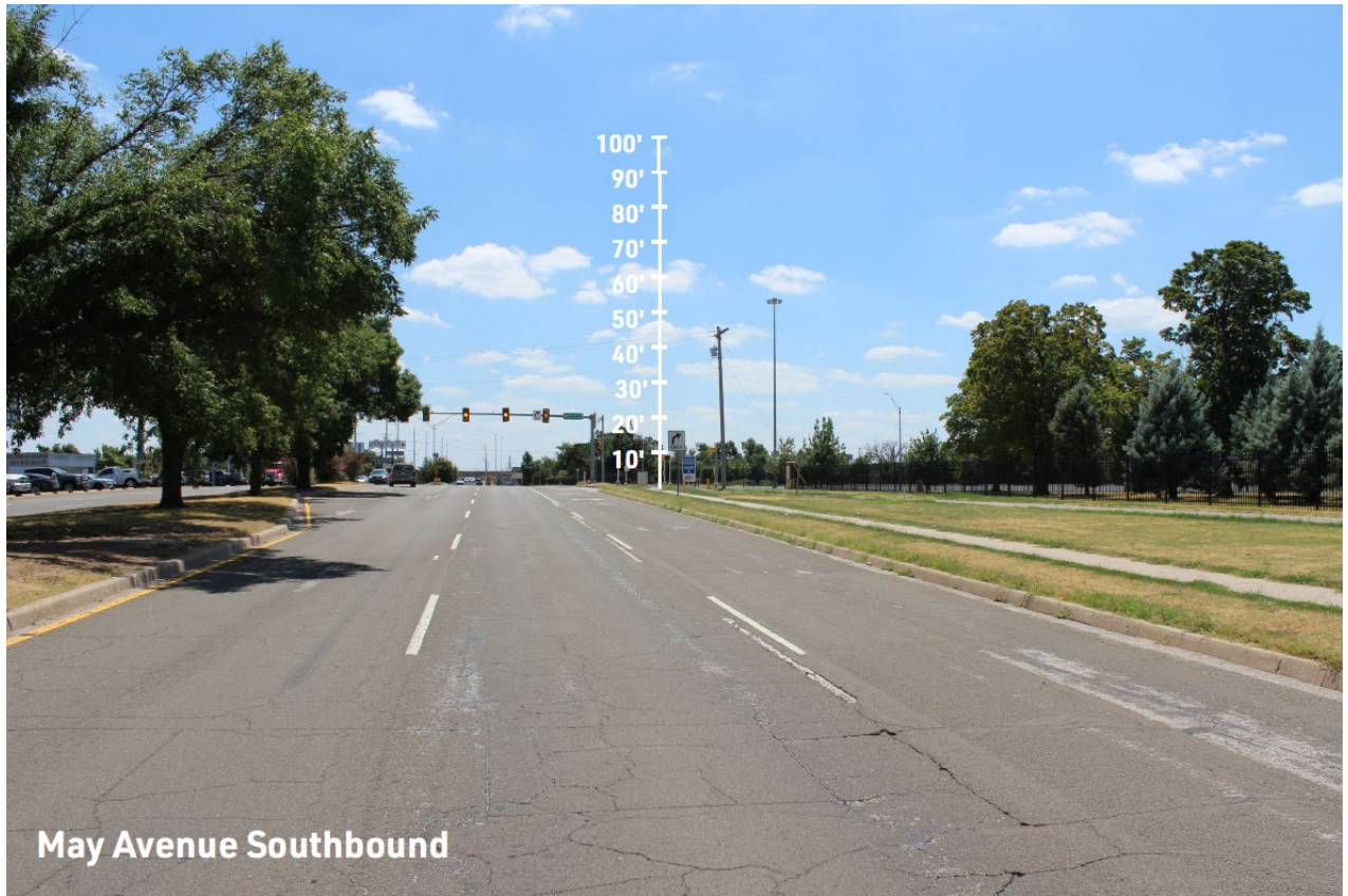
May Avenue Southbound