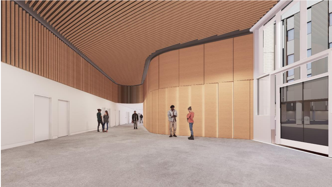
Figure 3: interior rendering to illustrate design themes (near multifaith chapel)