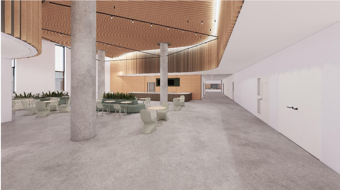
Figure 4: interior rendering to illustrate design themes (cafe)

Artworks will need to adhere to strict patient safety criteria. Please reference the resource section at the end of these guidelines for more details on acceptable materials and trauma informed design.