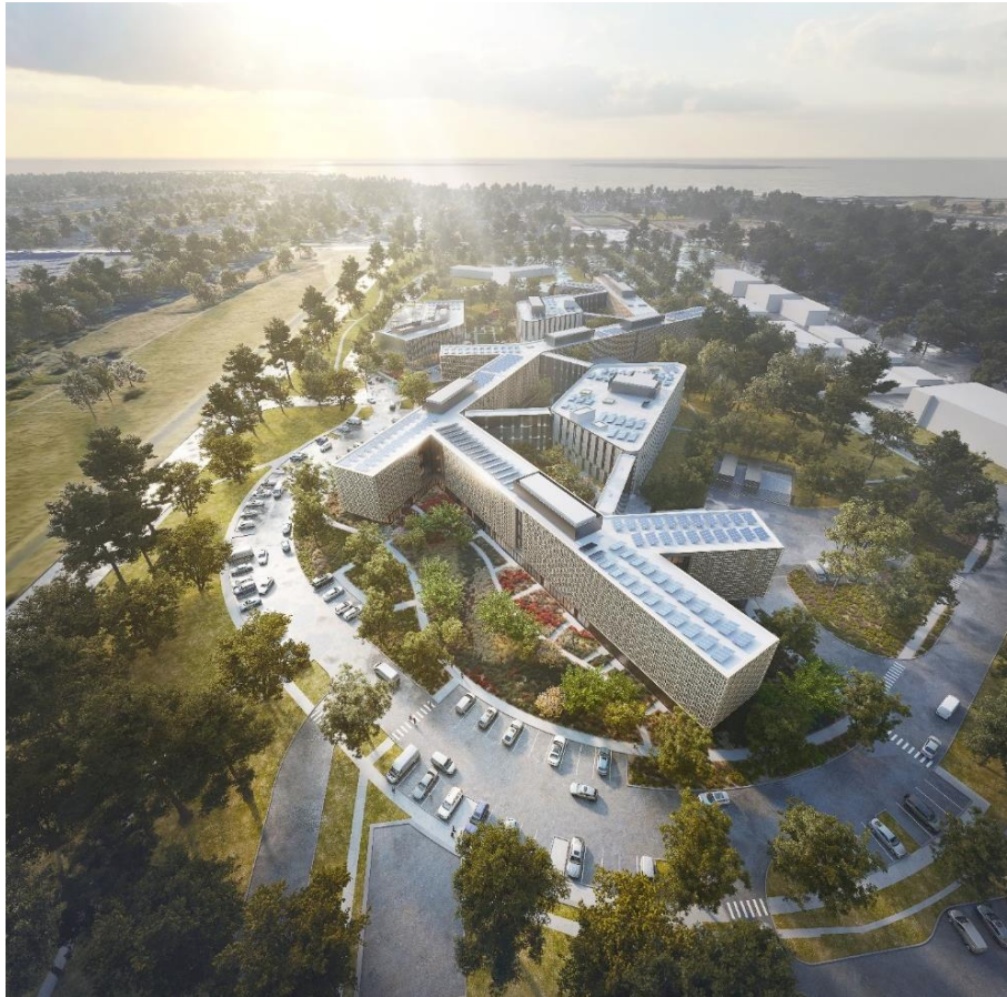
Figure 1: aerial rendering of the new WSH Forensic hospital

Washington State Arts Commission (ArtsWA) and Department of Social and Health Services (DSHS)