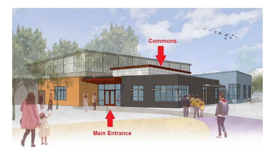
Design Rendering of Barrett Playground Recreation Center

See the floor plans, renderings, and details below for the specifics of each location.