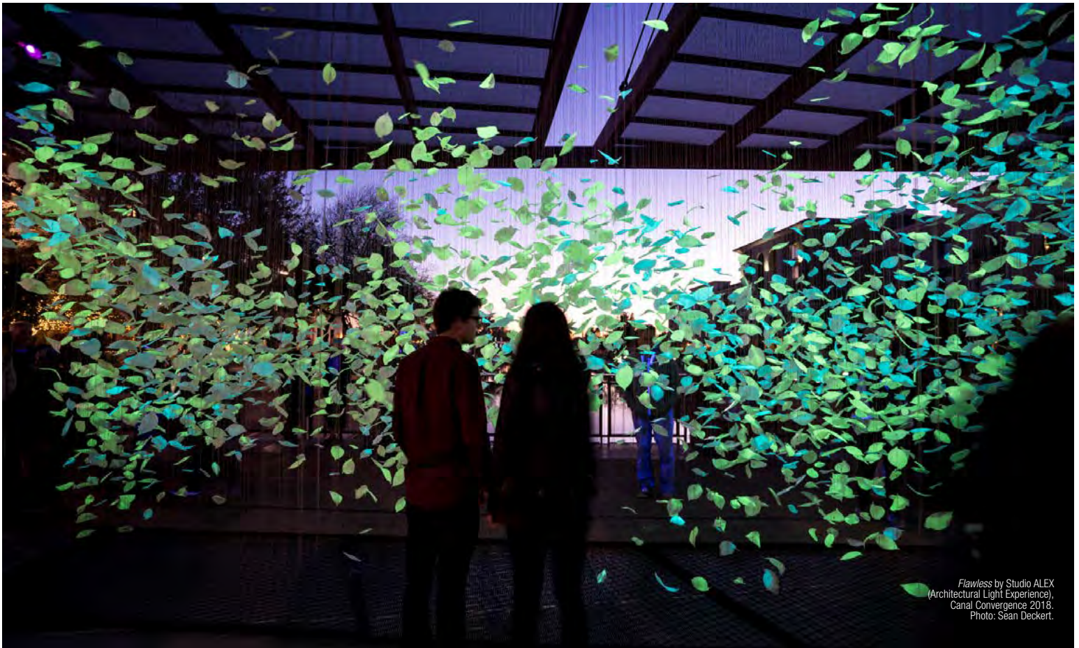
Flawless by Studio ALEX (Architectural Light Experience), Canal Convergence 2018.