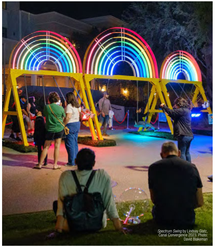
Spectrum Swing by Lindsay Glatz, Canal Convergence 2023.

See the following page for a more detailed overview of the Canal Convergence 2024 theme, Reflections.