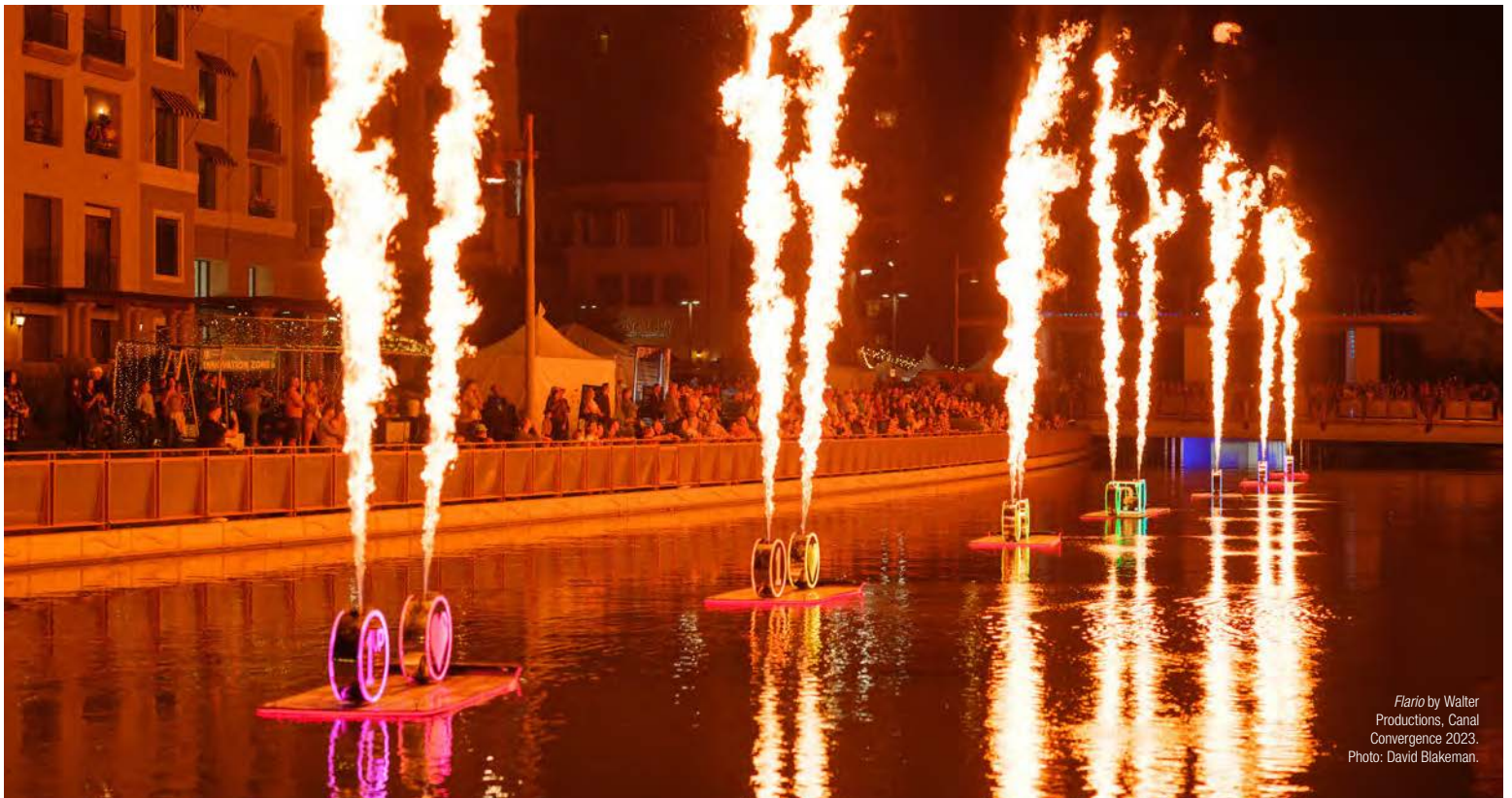
Flario by Walter Productions, Canal Convergence 2023.