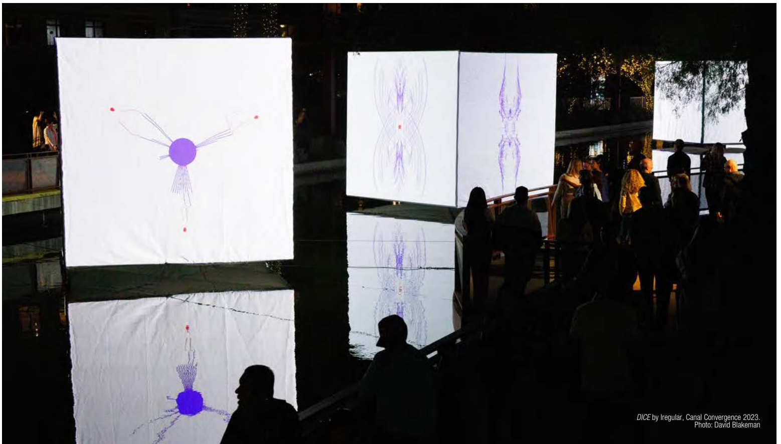
DICE by Iregular, Canal Convergence 2023.