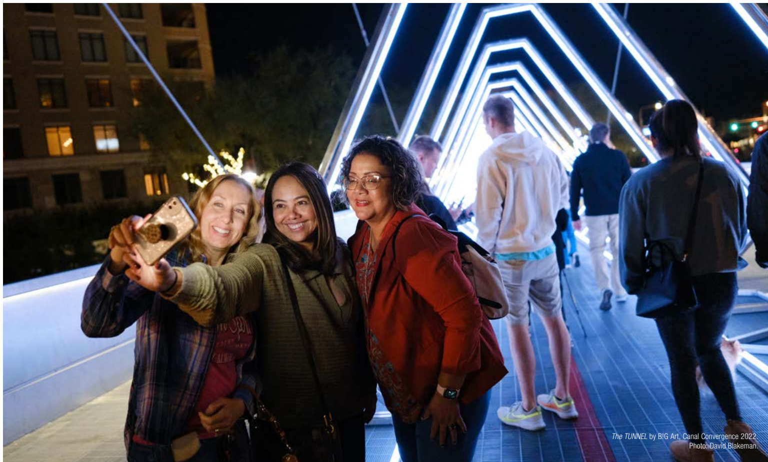
The TUNNEL by BIG Art, Canal Convergence 2022.