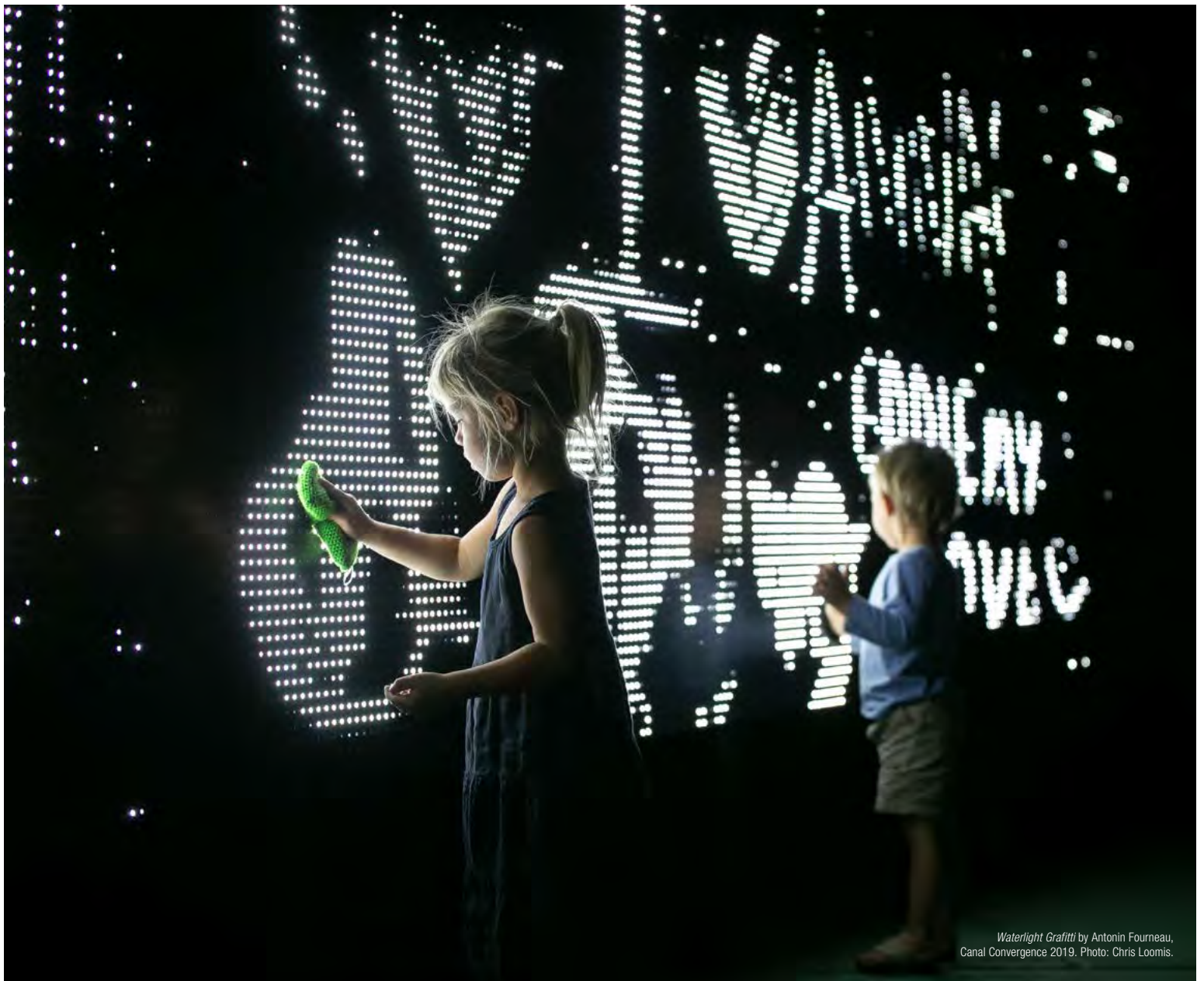
Waterlight Graffiti by Antonin Fourneau, Canal Convergence 2019.