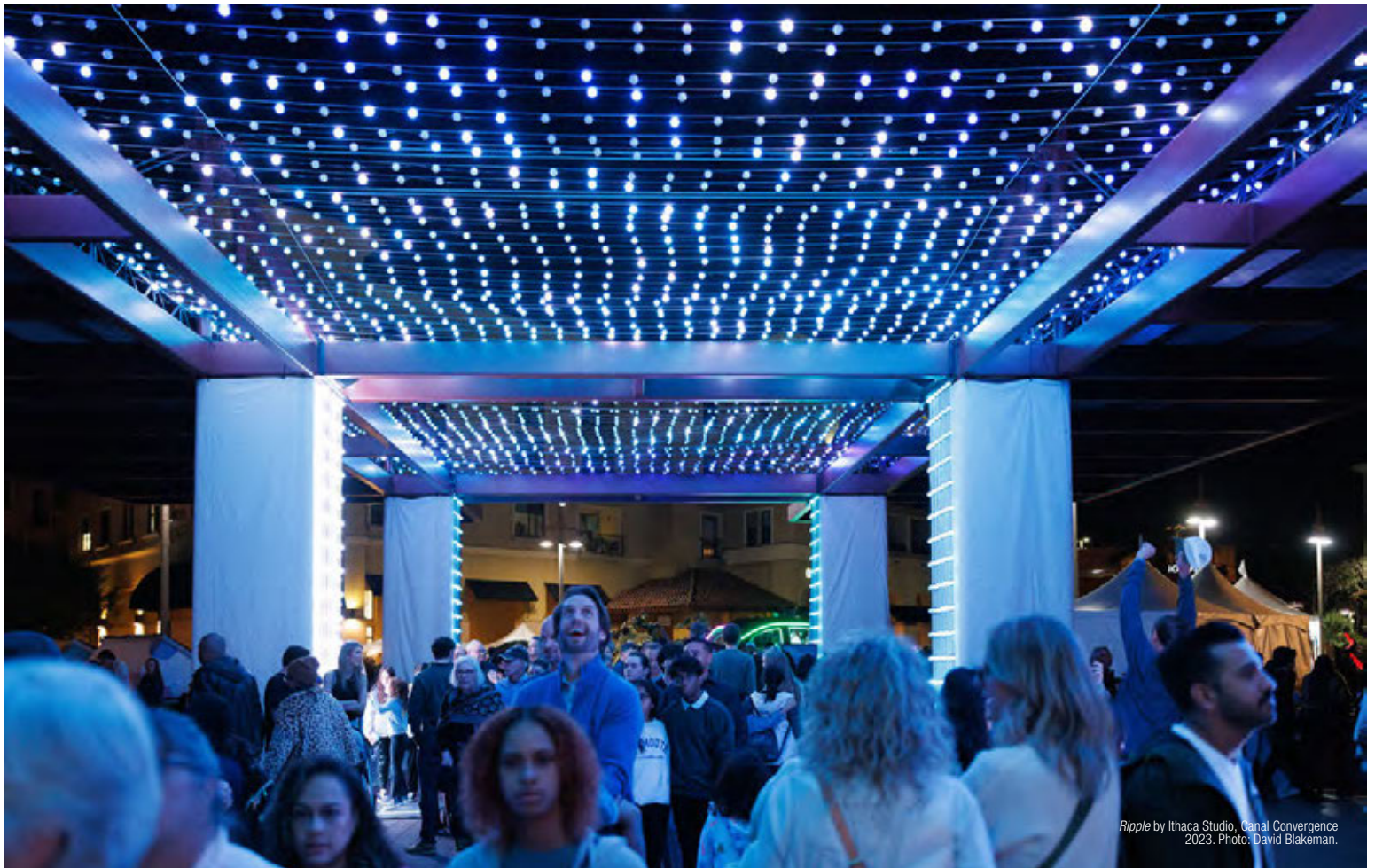
Ripple by Ithaca Studio, Canal Convergence 2023.