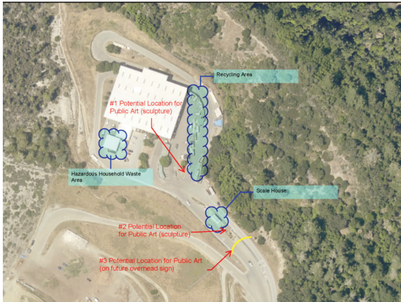
BLTS facility aerial

https://www.scparks.com/Home/AboutUs/WorkWithUs/CalltoArtists.aspx