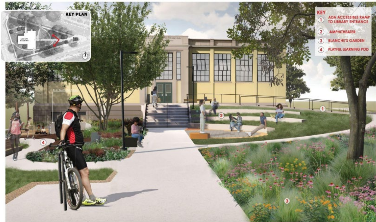
Design Rendering for the proposed renovations of the front of the library, outdoor seating, and garden from Salt Design Studio