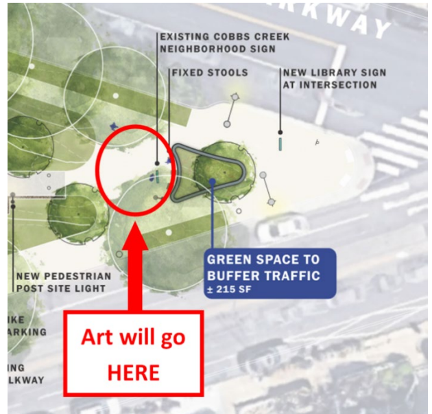
Close up site of where the art will be installed beside a new landscaped planting buffer and seating area.

The site for the Blanche A Nixon sculpture will be set into the existing pavement on the library grounds near the corner of Cobbs Creek Parkway and Baltimore Avenue. This location on the site is a hub where several walkways meet, and the sculpture will be prominently seen as people enter the main walkway to reach the library. The sculpture location will be framed by a new landscaped planting buffer and seating area that will be provided as part of the library renovations. Blanche's sculpture will welcome people to the library, as well as create an engaging space that is a destination unto itself. Semi-Finalists will be invited to imagine ways in which the sculpture will stand as a landmark of the library and will invite engagement and interaction with community members, residents, and visitors.