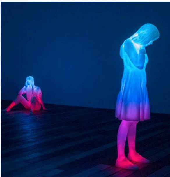
Doug Aitken- 3 Modern Figures (don't forget to Breathe)

This exhibition highlights both real world and imaginary projects that prioritize collectivity, humanity and social initiatives that benefit the community and provide the matrix for the arts' social coordination and economic support. Web3 integrations of public art on public blockchains is a perfect communion and will become a touchpoint for innovative communities around the world. Beyond the jpeg and beyond rooms and hands full of flat screens, the goal is to create a harmonious interaction between our phyigital realities. One that proposes a different degree of global accessibility to our collective cultural heritage. This show proposes to go beyond the restrictive binary of physical and digital, merging our analog relics with our digital future as a form of collective community expression.