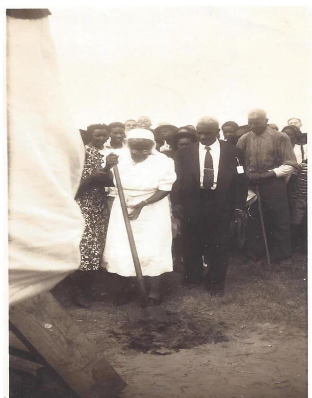
July 31, 1946 Local Paper MDJ or Atlanta Journal