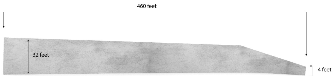
Rendering of the new concrete wall.