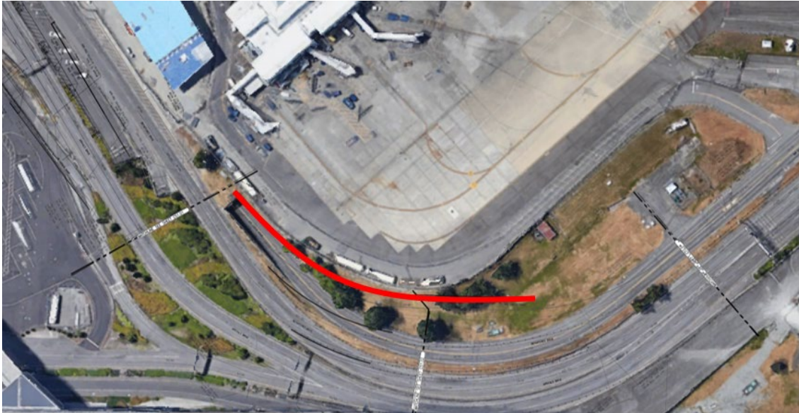
The rendering above shows in red the location of the new wall.

for this project has increased to include additional utility relocations and the renewal of utility infrastructure impacted by the project.